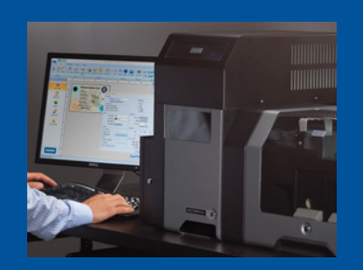
Asure ID: The perfect driver for the ultimate card personalization machine

The HDP8500 Lamination module is designed to work with the most durable consumables, ensuring long-life cards for small and large government ID programs. Clear and holographic overlaminate patches provide higher card durability and extended life to ID credentials, as well as lasting protection from fraud. The HDP8500 lamination module is the ideal system addition for producing ID cards that need to last.